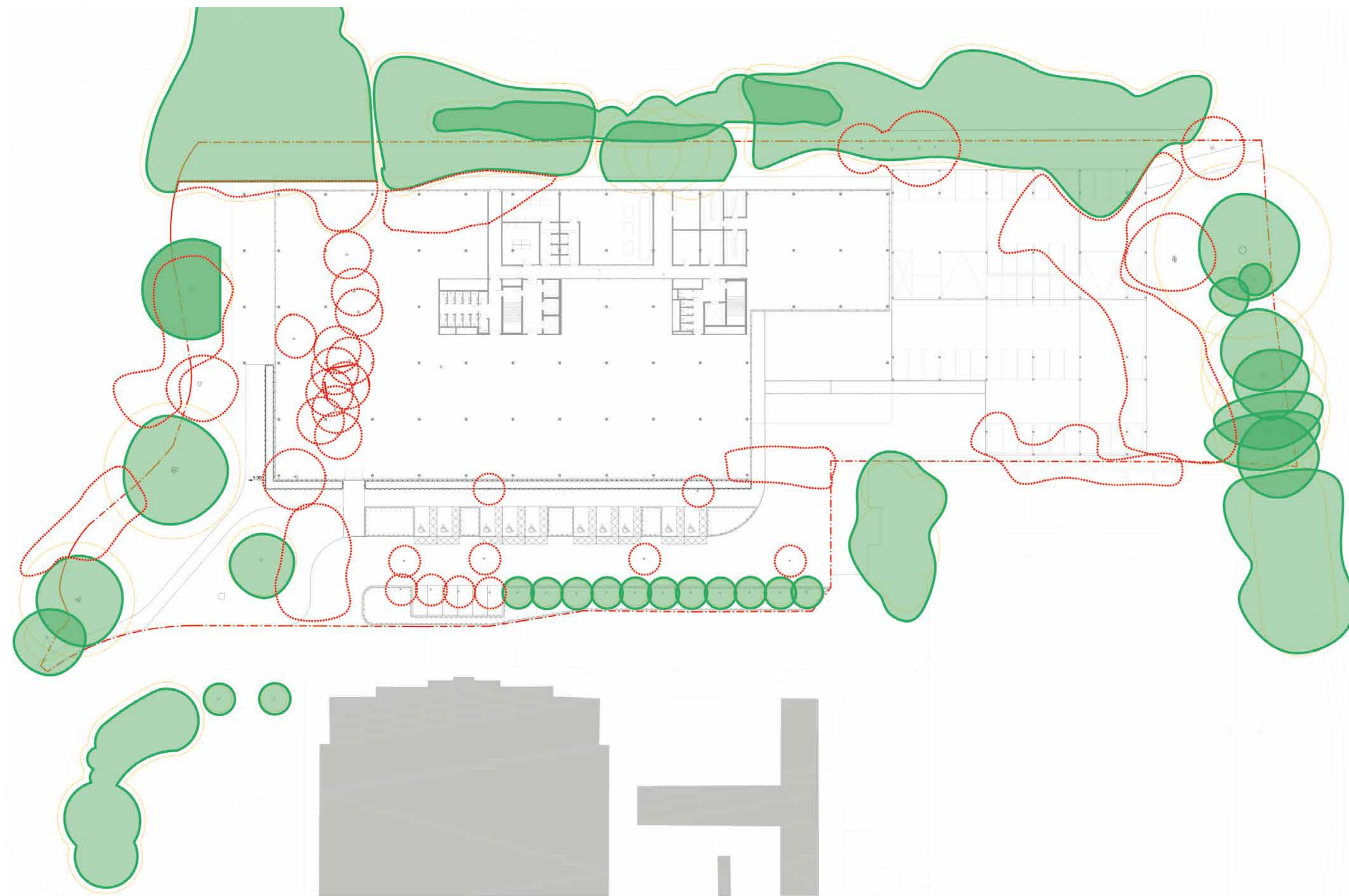
Proposed landscaping plan

We have focused on enhancing the open green space at the front of the site. We aim to retain as many existing and mature trees as possible as part of our proposals, while providing new planting and landscaping across the site. We will also be retaining the pond and incorporating this as a key ecological and design feature within our proposals.