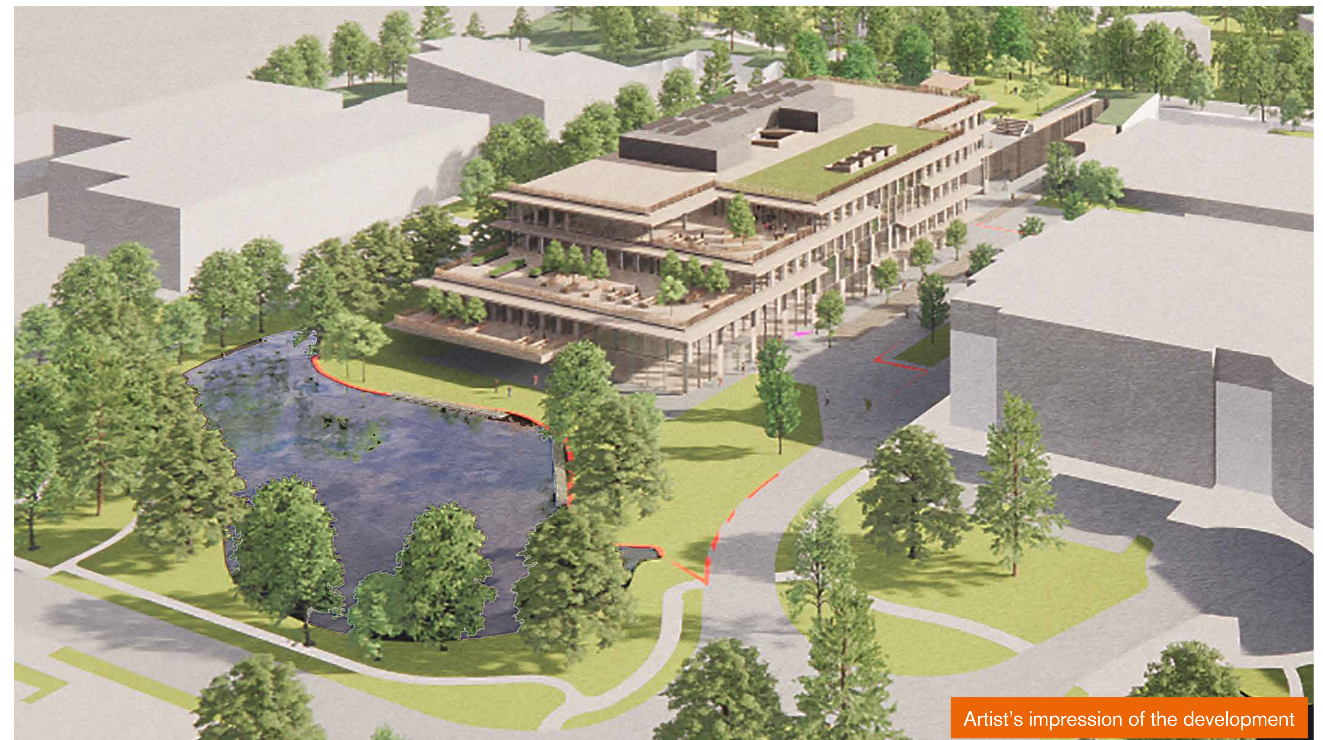
Artist's impression of the development